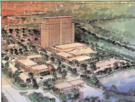
Artist sketches show how the face of Wheeling could change with the addition of the Westin - North Shore.