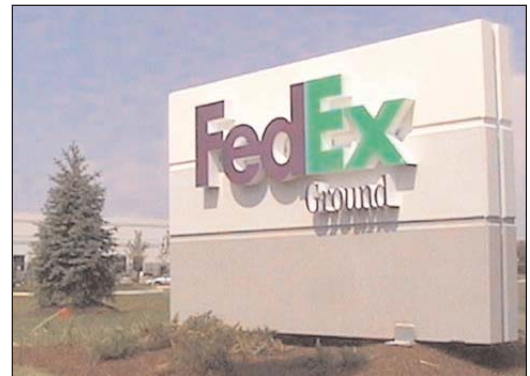
FedEx Ground and Hospital Laundry Services both opened their doors during the last several months and the new Northstar Plaza is scheduled for completion by this summer.