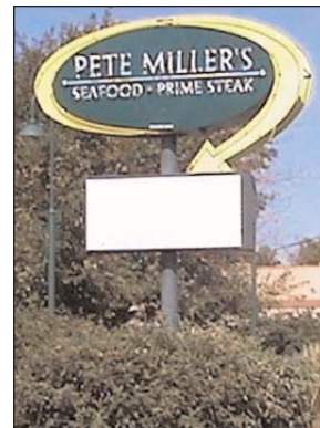
Pete Miller's assumed its place along Restaurant Row. It is not only renowned for its steaks and seafood, but for live jazz every weekend.

Whether you've lived in Wheeling all of your life or are a recent move-in, it's easy to tell that Wheeling continues to evolve into a 'Community of Choice.' You've probably noticed the glistening new condos and townhomes along Route 83 and Milwaukee Avenue, but Wheeling has also welcomed numerous businesses to town over the last several months. FedEx Ground opened its doors on Wolf Road and Hospital Laundry Services expanded its services during the last year. Pete Miller's Seafood and Prime Steak made an outstanding addition to Restaurant Row. A new retail site, Northstar Plaza, (pictured below) on Milwaukee Avenue is slated to open its doors by early summer. Among the new residential sites that are currently under construction are Astor Place and Prairie Park (both pictured above) that feature luxury townhouses and condominiums. These are just a few examples of why 2004 will continue to bring new and exciting changes to our Village.