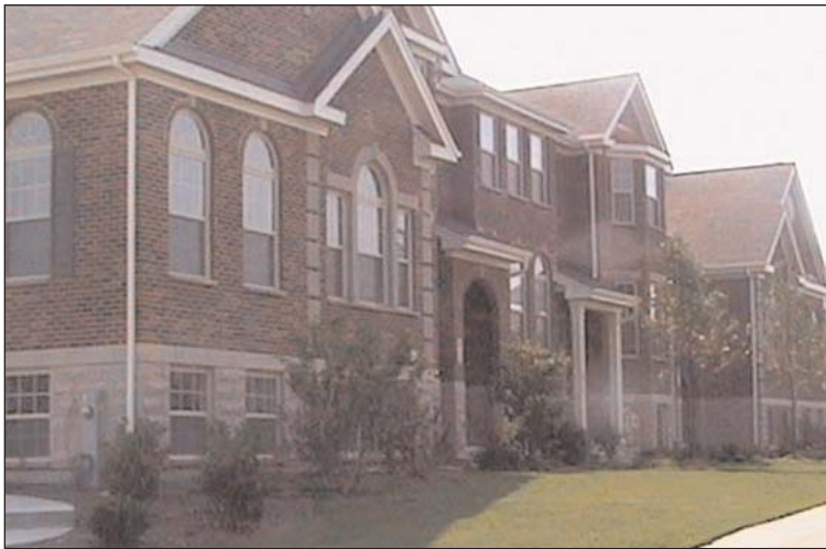
Astor Place (left) and Prairie Park (right) are two of the residential developments that are currently under construction in Wheeling. The two developments consist of luxury townhomes and condos.